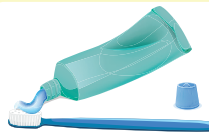
Brush my teeth