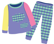
Put on my pyjamas